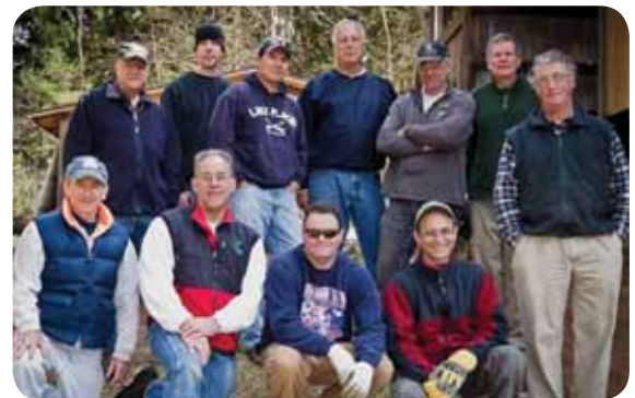
Trout Unlimited NorEast Chapter builds a new trail to the canoe dock at Riverbend, IRWA's headquarters in Ipswich. Thanks for helping people get out and enjoy the river.