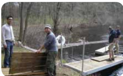
New England Biolabs volunteers install canoe dock. Members may use boats for free (Earth Day to Columbus Day).

Biodiversity Consulting, LLC New England Biolabs Inc. Teradyne, Inc.