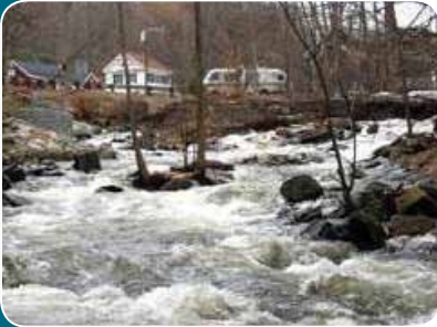
Removing this aging dam (Yokum Brook, Beckett, MA) restores natural flow and fish habitat while removing flooding and safety hazards.

With each passing year, we are getting closer to reconnecting large chunks of important fish habitat in the Ipswich River to each other ... and to the sea! Up until about 375 years ago, the Ipswich River ran freely from source to sea and thousands of migratory fish, including sea-run brook trout, river herring, shad, salmon and sturgeon returned every year from the Atlantic. The watershed is now interrupted by more than 70 dams that block fish migration and damage important habitat such as natural riffles and rapids.