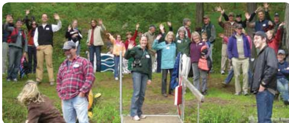
Over 50 people celebrate the 2011 opening of the Canoe Dock and enjoy Downriver ice cream together.