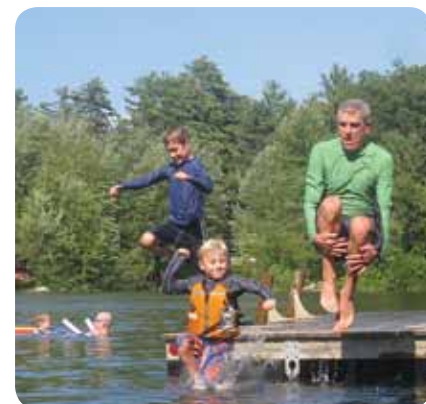
The Ipswich river is a great place to have fun with family and friends.