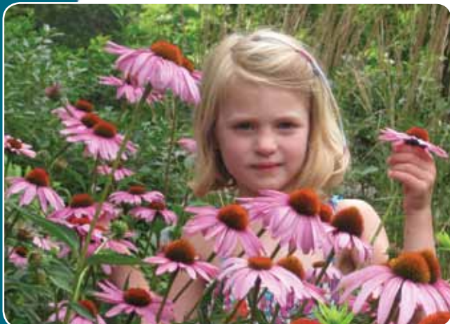
Maeve explores IRWA's native plant garden. Visit us to learn about Greenscapes first hand and enjoy a picnic, paddle or walk along the river while you're at it!

Seventeen towns are participating in Greenscapes North Shore in 2011. In order to help towns educate their citizens on how to save water and money, this year's Greenscapes educational materials include three new full color educational brochures (Creating a Healthy Yard, Recycling Water, and Be a Greenscaper). Greenscapes also provides four articles for local papers, access to a free homeowners workshop on compost tea and native gardens, the Greenscapes website and seasonal monthly E-Newsletters.