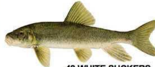
42 WHITE SUCKERS