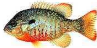
18 RED BREASTED SUNFISH