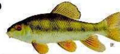
1 CREEK CHUBSUCKER