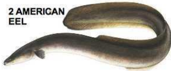
2 AMERICAN EEL