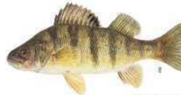
20 YELLOW PERCH