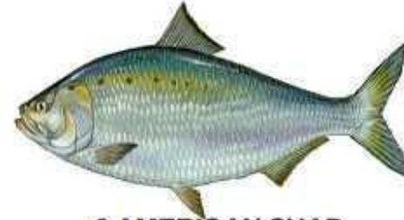
0 AMERICAN SHAD