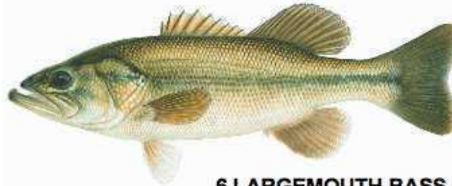
6 LARGEMOUTH BASS