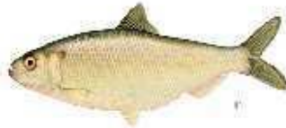
1 BLUEBACK HERRING