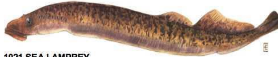
1021 SEA LAMPREY