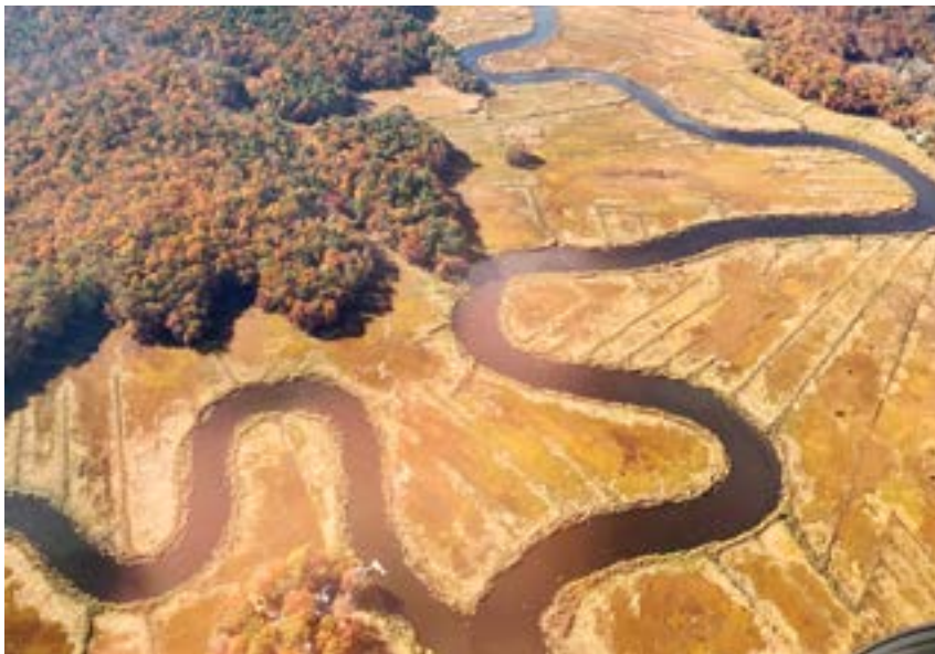
Conservation-minded pilots from LightHawk Conservation Flying took us 1500 feet above the watershed and we got this view of the Rowley River.