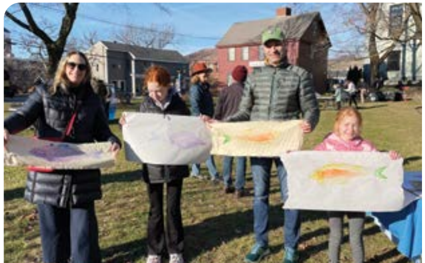
Families came out to make Gayotaku prints of shad last fall.