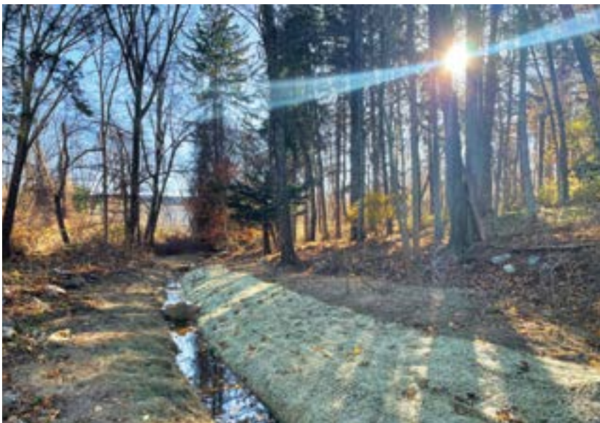
This past fall we daylighted this stream that had been underground for 100 years on our property at Riverbend.