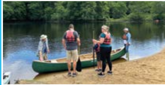
Above: Participants from across the watershed came together at Ipswich River Park to enjoy live music, fishing, canoeing, and even snake handling!