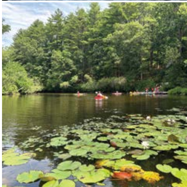
Young scholars from Girls, Inc. in Lynn enjoy a summer day on the Ipswich River.