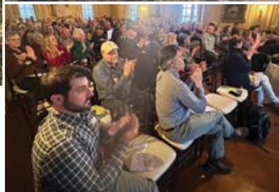
Clockwise from left: Volunteers from the Invasives task force work at Riverbend; IRWA staff and volunteers picked up 700 lbs of trash at our River Cleanup day; Members discuss river business at our 2024 Annual Meeting.