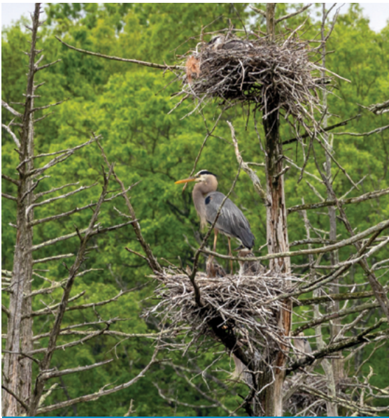
Herons in the rookery watch their young in Middleton, MA