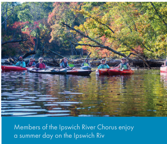
Members of the Ipswich River Chorus enjoy a summer day on the Ipswich Riv