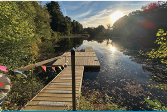
The dock at Riverbend basking in the late summer sun